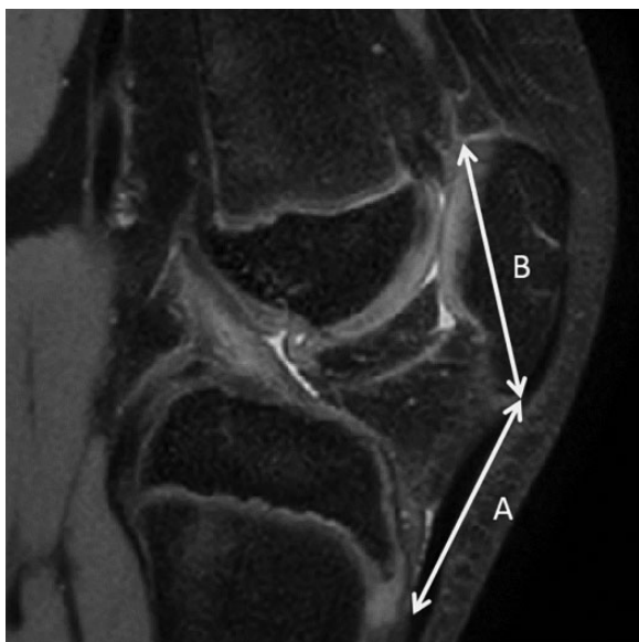
Figure 2. Schematic representation of the Insall-Salvati ratio: A/B , where A is the length of the patellar tendon and B is the maximum length of the patella. 1

The prevalence of femoral trochlear dysplasia was significantly higher in the ACL injury group than in the control group ( P < .001 ).