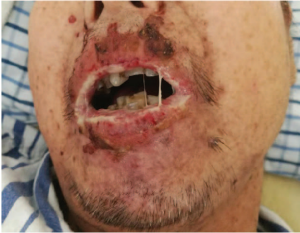
Figure 1. Multiple ulcers in the oral cavity, and lip erosion covered with white secretions.

erosions and polymorphic cutaneous lesions were initially diagnosed as Stevens-Johnson syndrome. Methylprednisolone 40 mg daily and ibrutinib 420 mg daily were administered for 1 week. However, his condition did not improve and the area of skin lesions expanded.