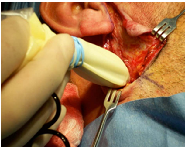
Figure 1 Handheld \gamma -probe used to localise the sentinel lymph node.

Information regarding age, sex, predisposing diagnosis, location of tumour, thickness, treatment modality used, location of sentinel nodes, incidence of SLN positivity, procedure-related complications and length of follow-up was collected prospectively.