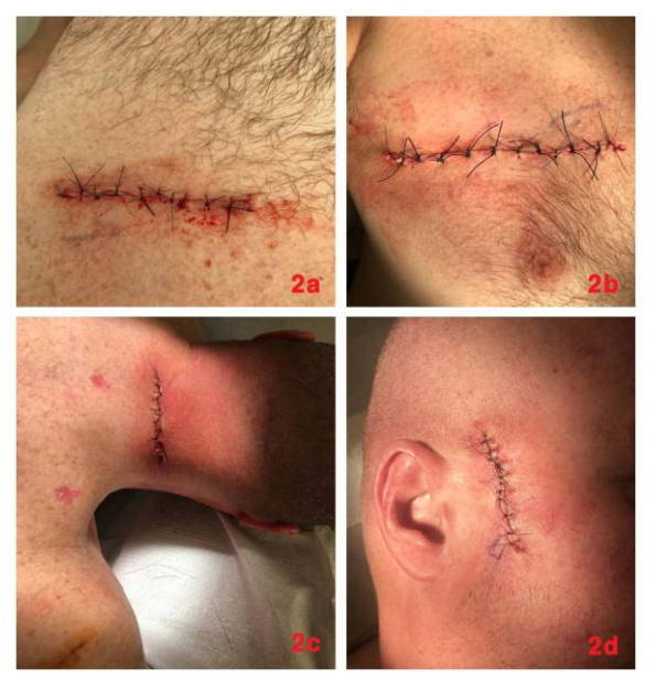
Figure 2: a-d) Clinical status postoperatively

Seven of the lesions were removed by elliptical excision with a field of operational security of 0.5 cm in all directions (Figure 2a-d). The histological examination showed a mixed histological picture: three multicentric BCCs with clean resection lines and four solid BCCs with free resection lines.