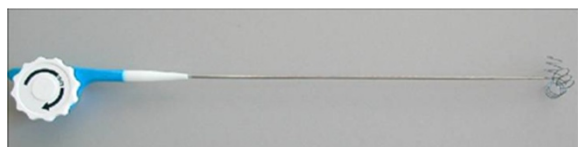
Figure 1 Flexible radiofrequency ablation 2.8-mm cooled-wet electrode used for radiofrequency ablation of the desmoid tumours.

In patients with GS, the treatment of DTs is an unresolved problem. Even if DTs are histologically benign in GS, they have real clinical malignancy. Many therapies have been proposed—surgical resection, pharmacotherapy