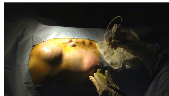
Figure 2 Intraoperative photography taken during the radiofrequency ablation procedure performed with ultrasonographic guidance.