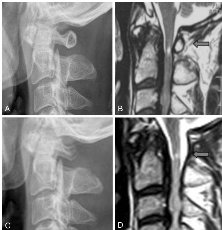
Fig. 2. Forty-nine year old male with cervical myelopathy. (A) Pre-operative lateral radiograph shows hypoplasia of the atlas and ossification of the posterior longitudinal ligament at sub-axial region. (B) T2-weighted MRI shows compression of spinal cord at the level of C1-2 (◄). (C) Post-operative (posterior C1 ring laminectomy) radiograph. (D) Post-operative T2-weighted MRI shows the well-decompressed spinal cord and restored subarachnoid space, but still present intramedullary high signal at the level of previous lesion (◄).

To understand the congenital malformation of the atlas, it is required to know about the process of its formation and development. Formation of the atlas starts to develop from the three ossification centers originating from the first sclerotome. Both lateral ossification centers begin growing posteriorly within six to seven weeks of embryogenesis to form the posterior arch and unite against each other within four months. The anterior center, however, forms part of the anterior tubercle and arch, and uniting with the two lateral