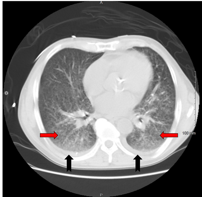
FIGURE 1: CT scan of the chest (axial view, lung window) at the level of the heart showing extensive, diffuse bilateral ground glass opacities (red arrow) without area of predominant consolidation and bilateral trace pleural effusion (black arrow), consistent with acute histoplasmosis in the patient with HIV.

Vasopressin. Further workup included blood cultures, urine cultures, Computed tomography (CT) scan of the chest. CT scan of the chest showed bilateral ground-glass opacities, pulmonary edema, and trace bilateral pleural effusions with a possibility of overlying atypical pneumonia (Figures 1-3). CT scan of abdomen and pelvis revealed retroperitoneal lymphadenopathy and other findings were unremarkable (Figure 4). Broad-spectrum antibiotics with vancomycin, cefepime, metronidazole, and azithromycin were initiated. The patient was then transferred to the Medical Intensive Care Unit (MICU) for continuous monitoring and management.