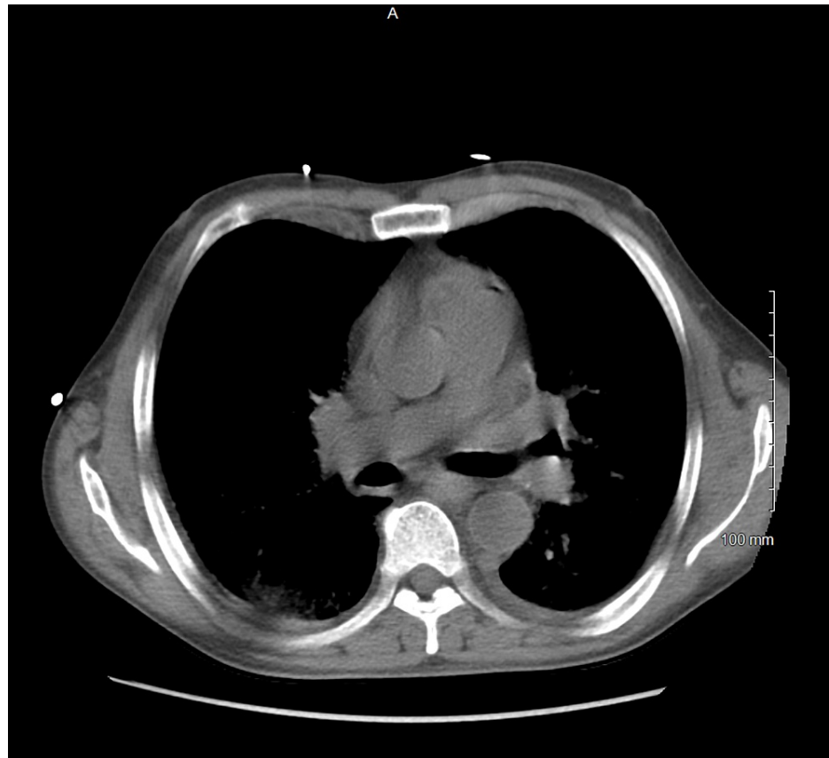
FIGURE 3: CT scan of the chest (sub carina level, mediastinal window) in the patient with acute histoplasmosis and HIV with no evidence of lymph node enlargement.