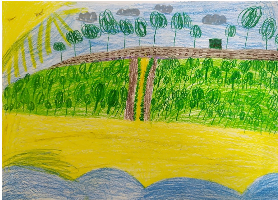
FIGURE 1: Drawing by the patient after the guided imagery scenario

The training intervention was intended to prevent her irritation from escalating, increase awareness, manage physiological arousal, and promote self-regulation skills. From the beginning, she seemed quite motivated to participate in the training and interact with the robot. She was very willing to meet NAO during the sessions and frequently talked about him to her parents and doctors. The repeated training routine encouraged her to practice the relaxation techniques more often during the day and create positive experiences in the hospital setting. Figure 1 presents the drawing she made based on the safe place imagery script in the last session.