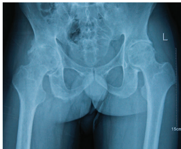
Figure 1. Preoperative anteroposterior radiographs of a 34-year-old man revealing narrowed joint space and marked osteophyte formation.

Despite significant advancements in the pharmacologic management of AS, THA is required for severe end-stage hip involvement