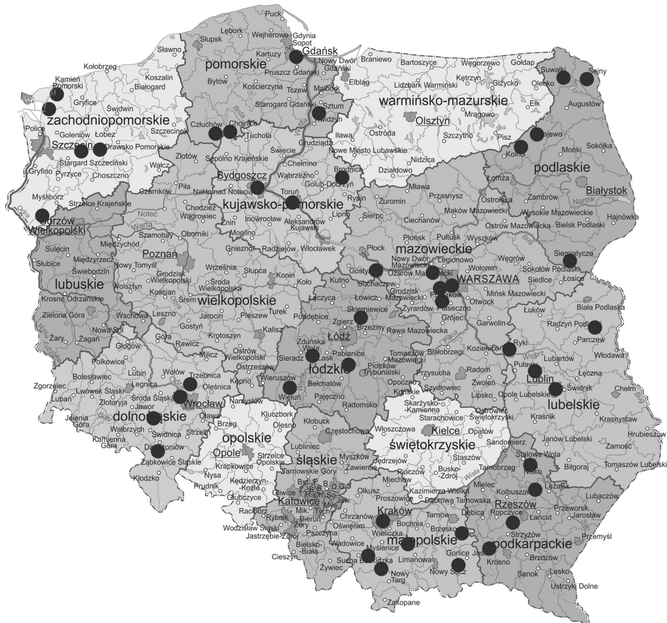
Figure 1 Locations of primary health care units enrolled in the study.

intensified the efforts to convince patients to participate in the programme. Furthermore, a short period predicted for the execution of the project could also have an effect on personnel motivation. We have to underline that the effort made by the personnel to recruit the patients from the list largely exceeded what can be expected on the routine bases. We showed the significant personnel time involvement. It was possible on a short time basis and with a financial incentive, but very likely would not be achievable in ongoing programmes. Moreover, we experienced a large non-response rate in PCHUs invited to take part in the project which could have resulted in self-selection of more motivated units. Its short duration could also prompt patients to take part in the study.