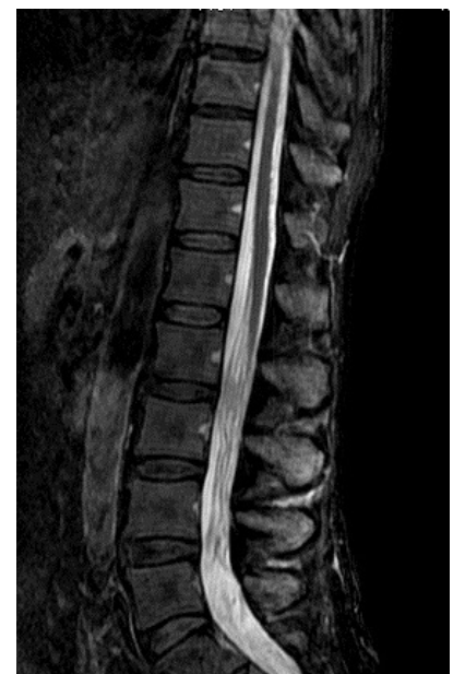
Figure 2. Magnetic resonance imaging of spinal cord (T2 image): pathological tissue infiltrating cauda equina, mainly in the vertebral body of L3, and intervertebral space between L2-L3.