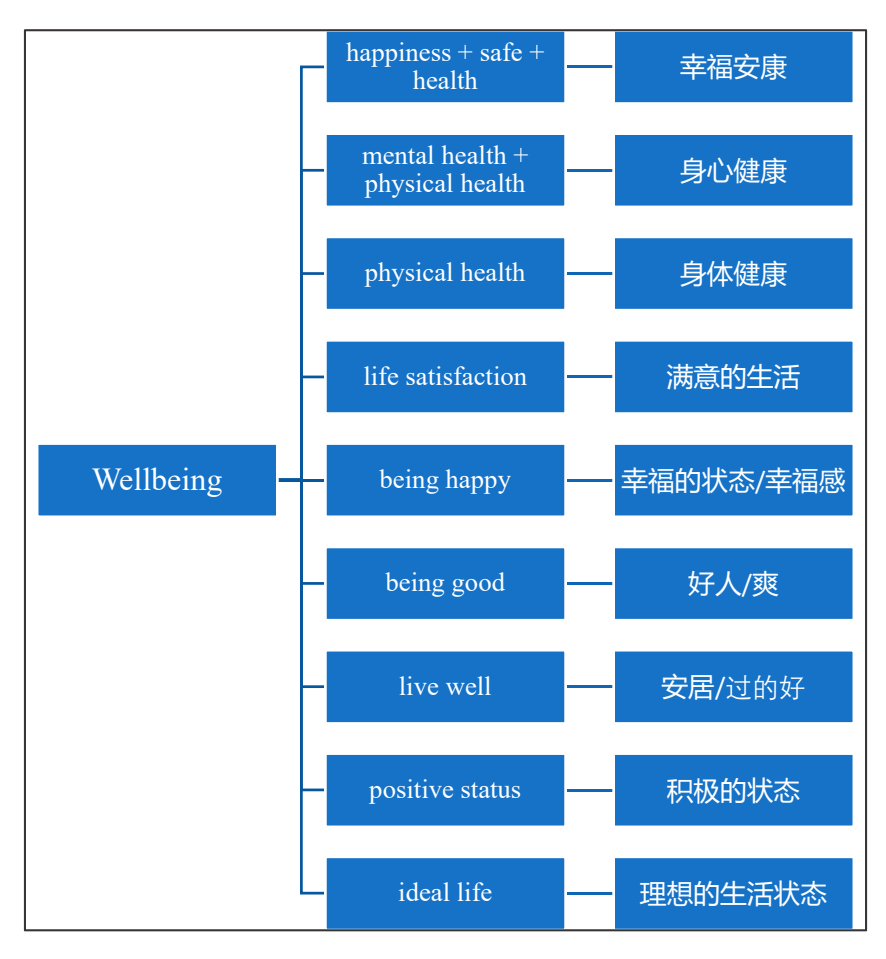
Figure 3. Participants' Chinese translations of the word "wellbeing".

the difficulty of accurate translate "wellbeing" into Chinese. For instance, one student noted: "It's hard because I couldn't find a suitable word to cover the meaning of wellbeing. I think there are so many things in it. It is difficult to describe and summarize wellbeing in a simple word."