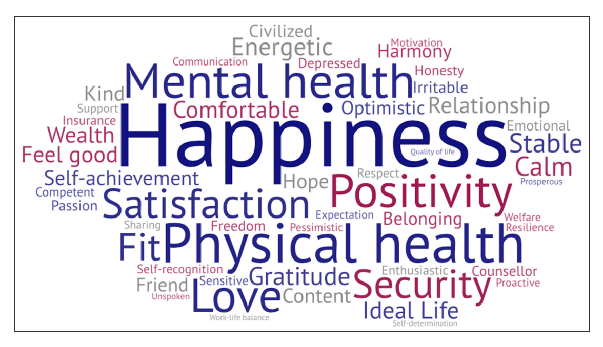
Figure 1. Words and phrases used by Chinese international students to communicate/describe wellbeing.

meaning for the colours. Aligned with the themes described above, "happiness", "physical health", "mental health", "love", and "security" were the most frequently mentioned words/phrases.