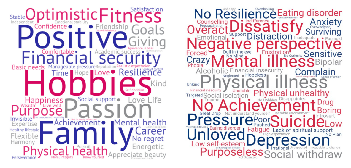
Figure 2. Words and phrases that participants used to describe a person high ( left ) and low ( right ) on wellbeing.

Participants were then asked to "describe a person with high wellbeing level" and "describe a person with low wellbeing level". Figure 2 illustrates the 57 words/phrases mentioned for high wellbeing (left) and the 74 words/phrases mentioned for low wellbeing (right). High wellbeing was seen in "hobbies" "passion", "family", and "positive". Low wellbeing included a broader range of words, but numerous words pointed to negative emotions and cognitions, and poor physical and mental health.