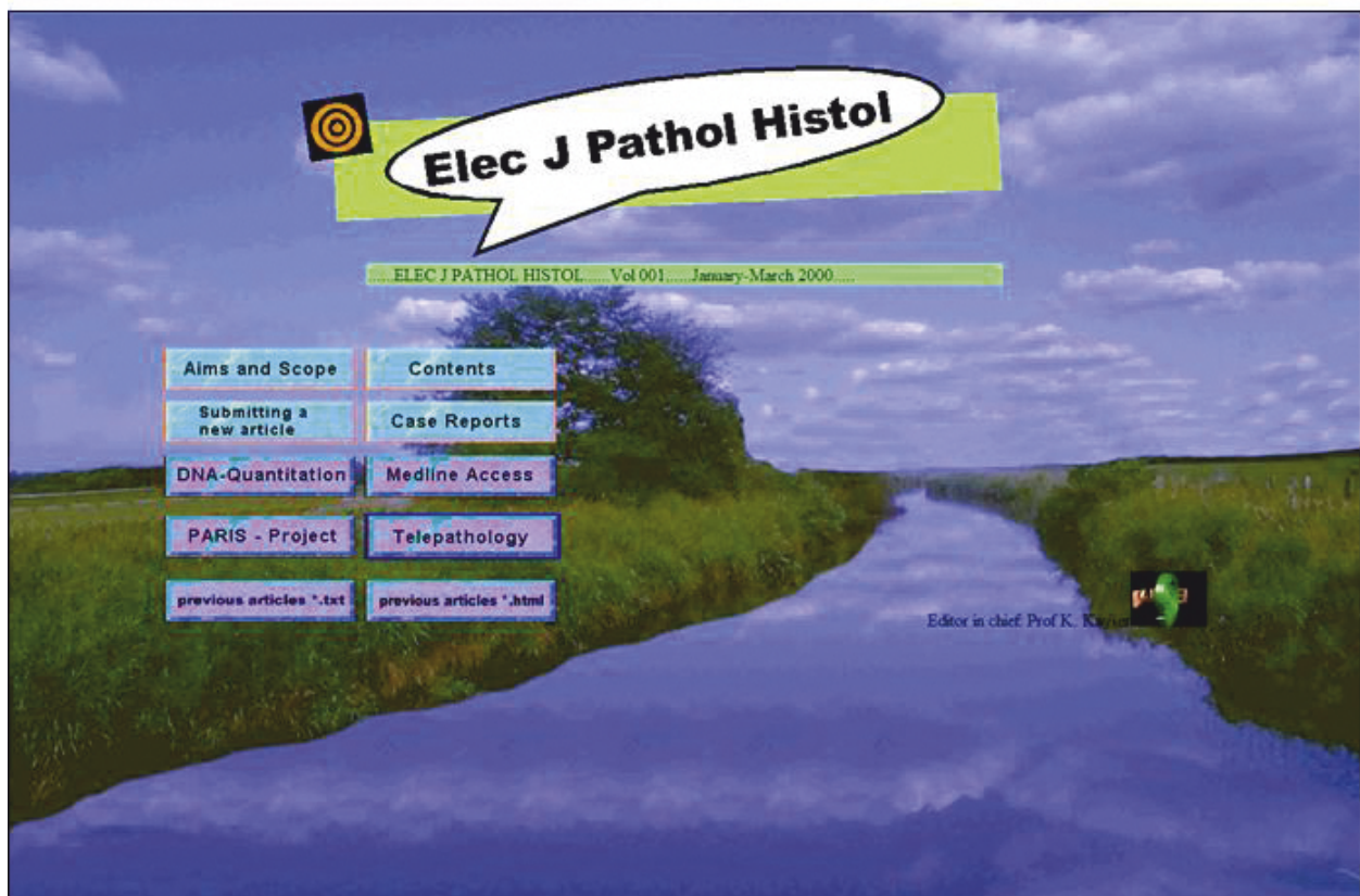
Figure 2 View of the front page of the Electronic Journal of Pathology and Histology.