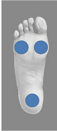
FIGURE 1: Position of factors under the sole of the foot (1st and 5th metatarsal-phalangeal joint region and heel).

Participants were excluded if they reported significant physiological problems based on question items on the modified PAR-Q. This included but was not limited to general health problems or severe sensorimotor impairments (e.g., neuropathies, chest pain upon exertion, dyspnea, infection, and functionally significant musculoskeletal dysfunction). Due to the potential effects of obesity on postural stability, individuals with a body mass index (BMI) > 30 \text{ kg/m}^2 were excluded.