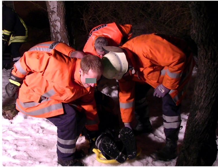
Fig. 3 realistic conditions stabilisation on an LSB

The team leader was responsible for the manual in line stabilisation of the cervical spine and was in command for the execution of the log roll manoeuvre. The team members had to place their hands on the opposite site of the patient's body: one on the shoulder and iliac crest, one on waist and below the knee and one below the distal femur and below the ankle. On command the manoeuvre was executed.