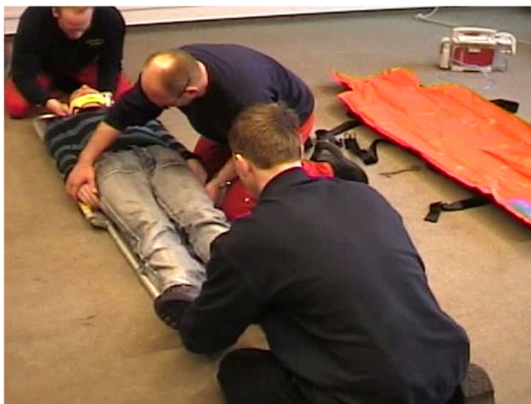
Fig. 2 ideal conditions stabilisation on a VM (positioning on a scoop stretcher)

The spinal stabilisation procedures were executed as follows: