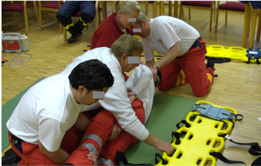
Fig. 1 ideal conditions stabilisation on an LSB

procedure did not influence the time needed for the SS manoeuvre itself.