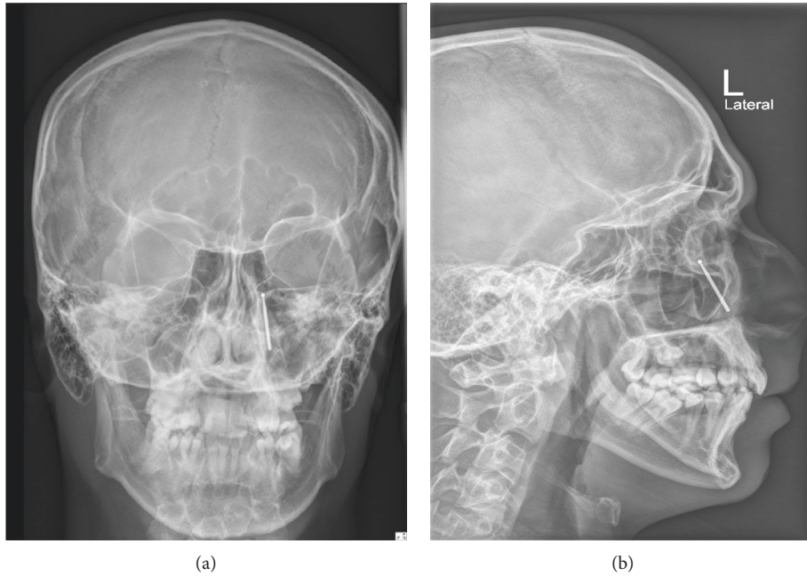
FIGURE 1: The anteroposterior and lateral view X-ray showing the radio opaque foreign body situated in the left maxillary sinus with head of the foreign body pointing posteriorly.