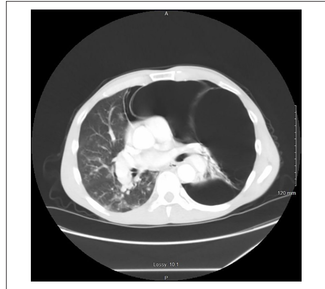
Figure 2. Computed tomography scan of chest with contrast demonstrates giant bullae in the hemithorax, atelectasis of the left lower lobe, peripheral pneumothorax in posterior medial sulcus as well as the anterolateral base of the hemithorax, marked mediastinal shift to the right, and consolidation with bronchiectasis in the right upper/middle/lower lobes.

Kupferschmid et al recommend that in these unclear cases, a video-assisted thoracoscopy for establishing a diagnosis. 4 Ferreira et al report a GBE patient mistaken for traumatic pneumothorax, who developed bilateral high-flow fistulas as a result of chest tube insertions prior to CT. 3 Chest tube placement is contraindicated in patients with extensive pulmonary blebs or GBE due to risk of bronchial fistula formation. Bronchopleural fistula is the abnormal connection between the pleural space and the bronchial tree. It is a complication of chest tube placement and can be difficult to manage and is associated with high morbidity and mortality. 5 Although our