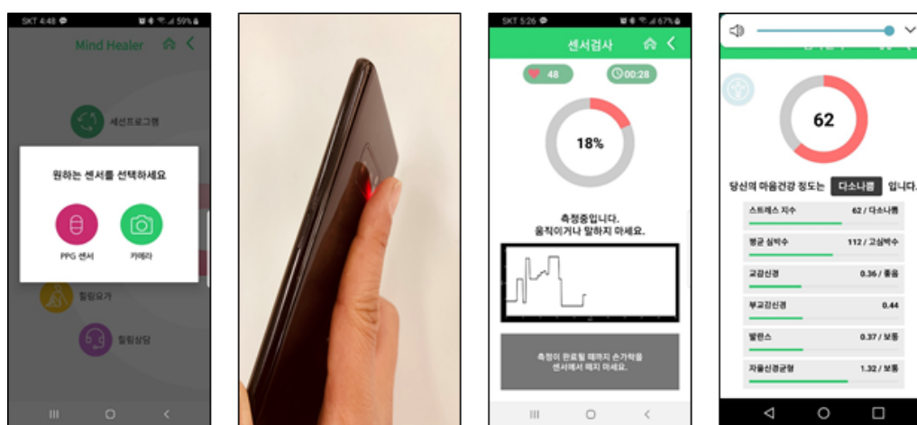
Figure 3. Photoplethysmogram (camera sensor for smartphones) sensor measurement and results. PPG and camera sensor option/Camera sensor apply/measurement/display of PPG.

(2) A biometric index sensor test was conducted to determine the stress measurement and mental and physical relaxation functions using photoplethysmogram (PPG) sensor or camera sensor which installed in the smartphone. The PPG sensor is a device that projects light with a particular wavelength onto the measured object, detects the light that is reflected off or goes through it, and detects the pulse signal from the user. Then, it converts the detected pulse signals into digital data to define stress indices by using pulse measurement methods (Figure 3) [24]. As a technical method of measuring and analyzing heart rate, the stress index is measured by grasping the average heart rate, sympathetic, parasympathetic, and autonomous balance [25,26]. PPG is a simple and inexpensive optical technology that is efficient for calculating pulse rate variability (PRV) [27,28]. Measurement of heart rate variability (HRV) is known to have information on very-low-frequency (VLF) and low-frequency (LF) sympathetic nerves, and high-frequency (HF) parasympathetic nervous system, especially the vagus nerve and respiratory activity. By calculating the value, it is possible to know whether the user is in a stress state [29]. To characterize HRV, many authors [30,31] have proposed a variety of hand-crafted HRV metrics that are computed over time intervals between heart rate.