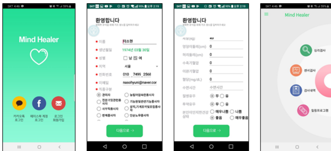
Figure 2. Basic composition of the Mind Healer App. Login screen/Input page of Personal information/Input page of perceived health status/Psychological test and sensor test page.

Figure 2 shows the main screen of Mind Healer, which consists of a psychological test, a sensor test, and a healing program that identify users' condition. It was designed so that information can be entered to identify users' health-related information and general characteristics.