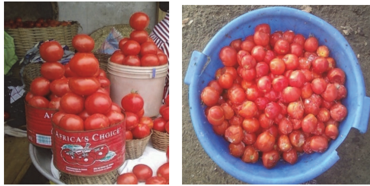
(a) Fresh tomatoes