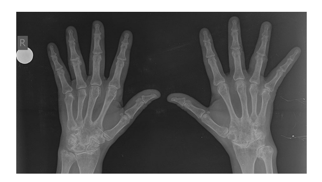
Fig. 3 Established RA: diffuse osteopenia, subluxations, joint space narrowing, bone erosions, and ankylosis affecting mostly the carpal and the carpometacarpal bones. Severe disease in a 50-year-old woman with a history of seropositive RA since the age of 31