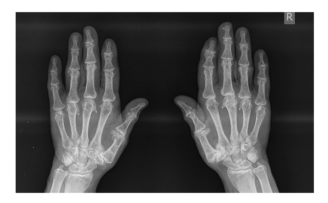
Fig. 4 CPPD disease: hook-like osteophyte formation affecting the MCPs (*) and scattered calcifications seen on CMCs and the PIPs in a 65-year-old male, with symmetrical polyarthritis affecting the small joints of the hand for the previous 5 years

Conventional synthetic (cs) disease-modifying anti-rheumatic drugs (DMARDs) like MTX and hydroxychloroquine (HCQ) have been used in some patients with controversial results [24–26]. Finally, Anakinra, an interleukin-1 (IL-1) receptor antagonist has been used in severe cases [27].