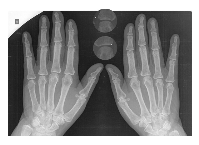
Fig. 2 Early RA: marginal erosions of the 4th right MCP (*) and the 4th left MCP in a 58-year-old female with a history of seropositive RA since 12 months. Also note the soft tissue swelling affecting mostly the 3rd and 4th PIPs of the right hand