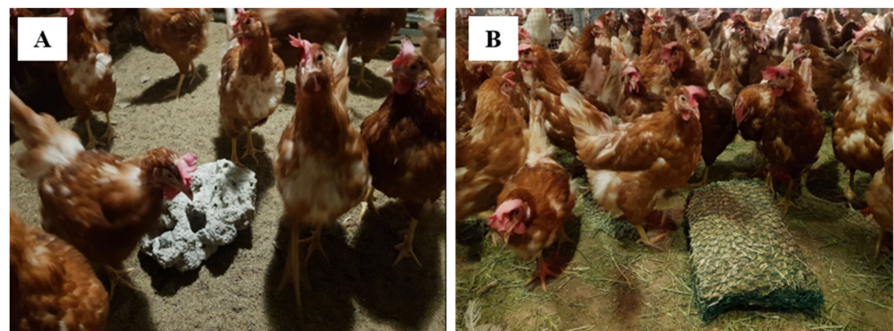
Figure 1. Environmental enrichment through different types of pecking materials. (A) Pumice stone; (B) alfalfa hay.

The pecking materials used were pumice stone and alfalfa hay (Figure 1A,B, respectively). Pumice stones from Mt. Baekdu were purchased from a bonsai shop (Wonju, Korea) and all stones were selected to be similar in size: approximately 24 cm in width, 17 cm in depth, and 20 cm in height. Alfalfa hay was purchased from Apet (Busan, Korea), with the sizing of the hay products measuring 30 cm wide, 21.5 cm deep, and 15 cm high. The pecking materials were considered at a ratio of 1:46 hens, with four materials distributed evenly in each pen. Each pecking material provided on the start date of the experiment was maintained without replacement during the experimental period.