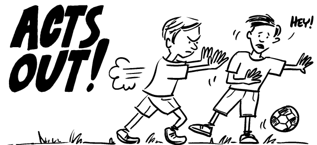
Fig. 2 Poor behavior in school: early indicator of a child needing mental health assistance