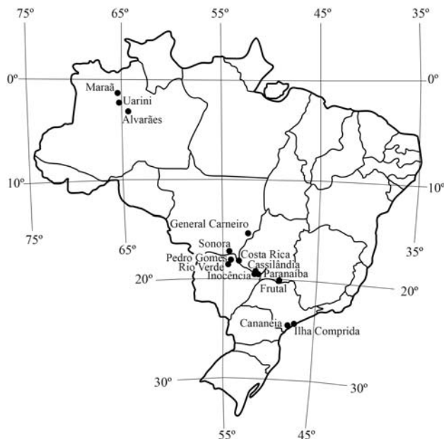
Figure 1 - Map of Brazil showing the municipalities sampled in this study.

DNA was extracted from recently expanded young leaves of each accession and then dehydrated for 72 h at 60 °C by using a modified CTAB method (Elias et al. , 2004). Fifty milligrams of ground powder were transferred to a 1.5 mL micro-tube containing 800 µL of CTAB extraction buffer [30 mM EDTA pH 8.0, 0.1 M Tris-HCL pH 8.0, 1.2 M NaCl, 3% CTAB, plus 1% 2-mercaptoethanol added