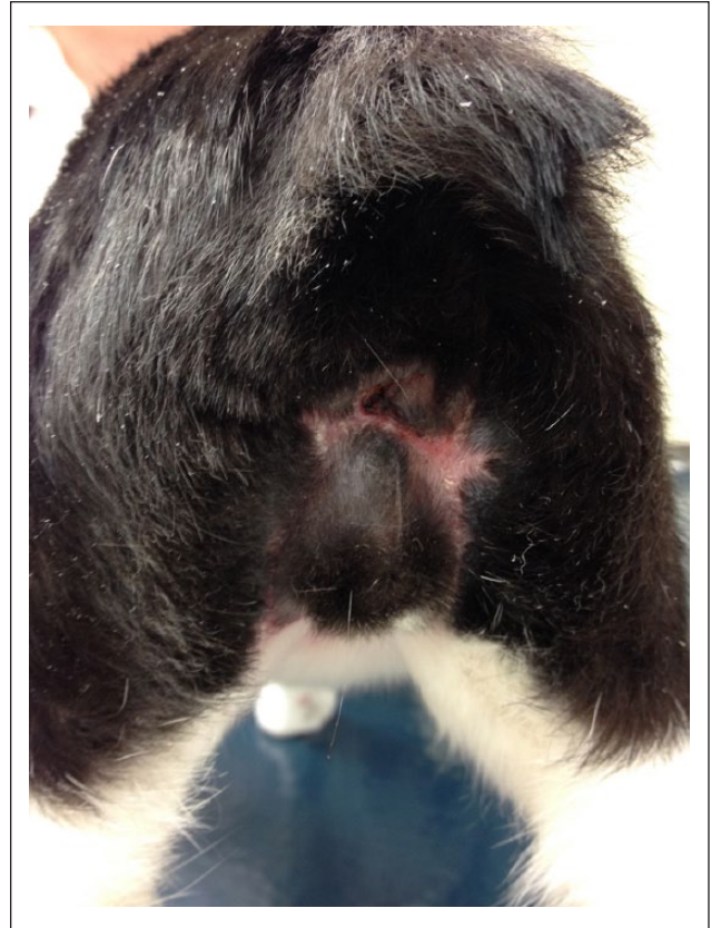
Figure 4 Day 57 post-presentation of case 1 illustrates complete wound healing, at which time normal anal tone was present and the fecal incontinence had resolved. The cat was neutered 2 weeks later

USA, for an evaluation of acute-onset vomiting, tenesmus and lethargy. The cat's diet consisted of Nutro Natural Choice adult dry cat food, with the canned variety occasionally added in. Examination revealed the cat had a slightly elevated temperature (39.3°C), with tacky mucous membranes and tachycardia (230 bpm). Upon palpating the abdomen, tenesmus was induced with only a clear mucoid discharge produced. The bladder palpated soft and small, and a rectal examination revealed an empty colon with clear mucous on the glove.