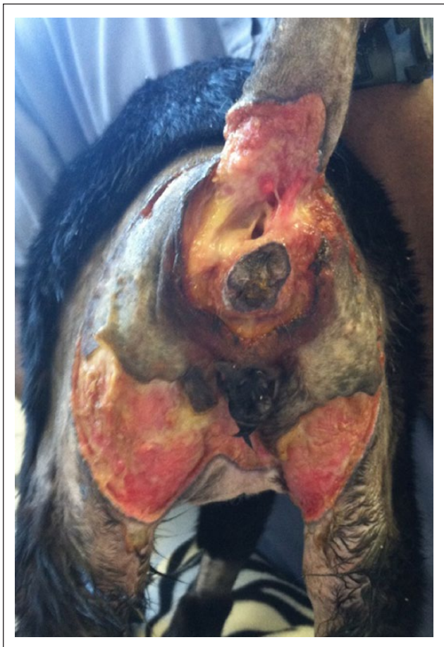
Figure 5 Day 18 post-presentation of case 2 illustrates the extent of the wound at its worse. The necrotic tissue has started to slough, with a portion of necrotic skin still present

A CBC revealed resolution of leukopenia and thrombocytopenia (see Table 5), and serum biochemistry was unremarkable (see Table 6). The previously prescribed therapy (buprenorphine and amoxicillin/clavulanic acid) was continued for an additional 2 weeks, and the cat began cold laser therapy of the wound the following day.