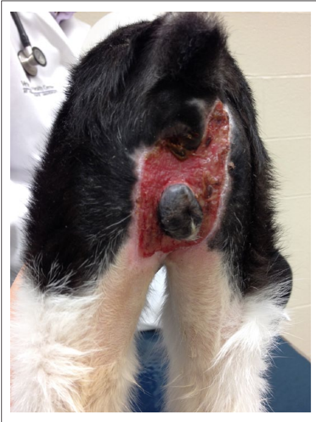
Figure 3 Day 30 post-presentation of case 1. The necrotic tissue has completely sloughed on its own, revealing significant wound contraction and presence of granulation tissue