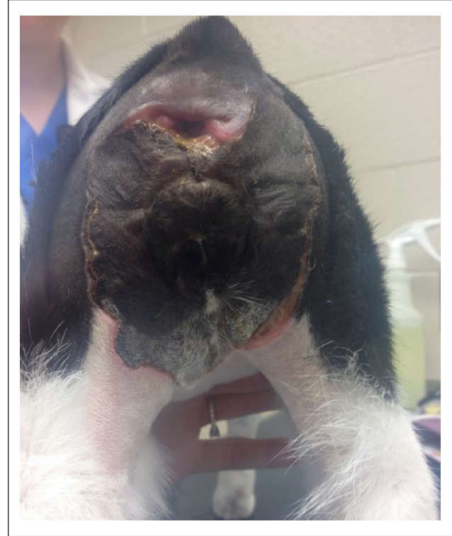
Figure 2 Day 11 post-presentation of case 1 illustrates the extent of the necrotic lesion, with the wound edges pulling away from the underlying tissue. The necrotic skin was left in place to protect the underlying tissue from fecal contamination

and the cat was more active and began to eat. Cellulitis was noted on the caudal ventral abdomen extending around the prepuce, scrotum and rectum, and significant pain was elicited when palpating the lumbar–sacral spine. A repeat CBC revealed an improved total WBC, with neutropenia and elevated bands with moderate toxic changes in neutrophils (see Table 1). Significant abnormalities on serum biochemistry revealed a persistent hypoproteinemia, hypoalbuminemia, increased creatine kinase and hyperbilirubinemia (Table 2).