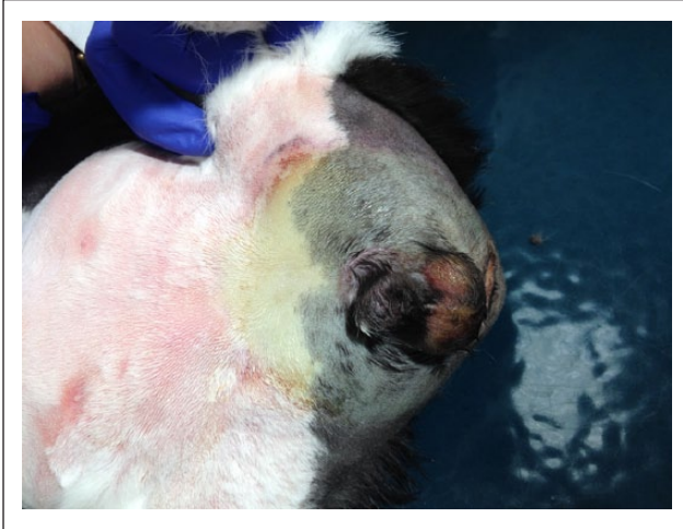
Figure 1 Day 4 post-presentation of case 1 illustrates the first indication of necrotic skin formation as seen by the yellow–gray skin discoloration that extends 5 cm cranial to the prepuce, 1 cm lateral to the scrotum and prepuce, and extends toward the lateral and caudal margins of the tail base. A tissue marker was used to outline the delineation between normal and abnormal skin for the purposes of monitoring for further progression