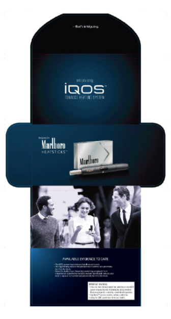
Figure 2 Reduced exposure message and an example of marketing materials from study THS-PBA-05-REC-US. In study THS-PBA-05-REC-US, all marketing materials carried a reduced exposure claim. PBA, Perception and Behavior Assessment; PMI, Philip Morris International.

therefore, mislead the public. While few studies outside the tobacco industry evaluated consumer perceptions of reduced risk or reduced exposure claims for non-cigarette tobacco products, <sup>32–34</sup> the results were similar. El-Toukhy et al <sup>34</sup> found that modified exposure claims reduced perceived risks of snus and e-cigarette products among adults and adolescents. These results indicate that perceptions of exposure and risk are highly correlated and communication about one— either lower risk or lower exposure—reduces perceptions of both risk and chemical exposure.