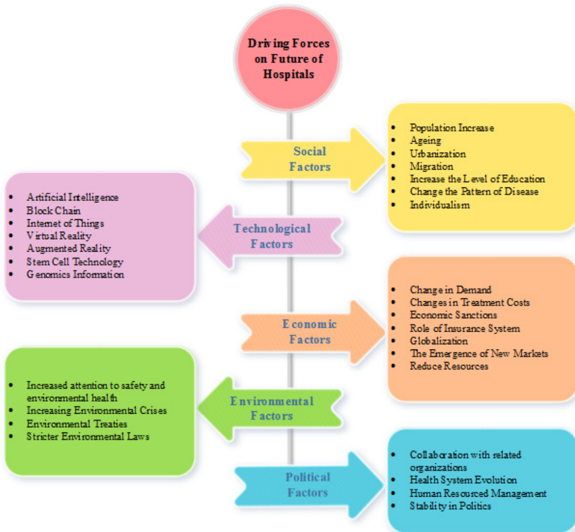
Fig. 2. Drivers of the future of hospitals