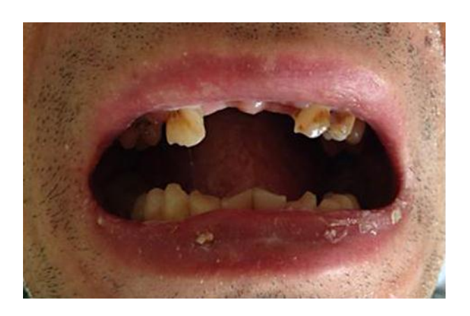
Fig. 3. Oral photograph. Ten teeth were extracted after initial surgery.

Fukuchi et al.: Descending Necrotizing Mediastinitis Treated with Tooth Extractions following Mediastinal and Cervical Drainage