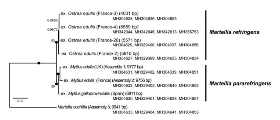
Fig. 1. Bayesian phylogeny of the three full length rRNA gene array assemblies (1–3; two from Mytilus edulis infected with M-type Marteilia refringens from the UK and France, and Cerastoderma edule from Spain infected with Marteilia cochillia ) with the longest incomplete array sequences (all >4 kbp) generated from O-type infections of Ostrea edulis from France and Mytilus galloprovincialis from Spain (M-type). Numbers of positions of each sequence are given in brackets. 10 096 positions were analysed; incomplete sequences were padded with missing data points. Bayesian posterior probability (BPP) supports and Maximum Likelihood bootstrap supports are shown at each node. Blobs indicate BPP = 1.0.

ITS amplicons from all M. edulis tissue samples from the UK and Sweden positive for M. refringens by histology and/or lineage-specific PCR were pooled into six batches (TAM-1, TAM-2, TAM-3, TAM-4, SWE-1, SWE-2) as shown in Table 2. The DNA content of samples comprising each pool was equalized. For each pool, a sequencing library was constructed using the TruSeq DNA PCR-Free Sample Preparation Kit (Illumina). The TruSeq Nano DNA Sample Preparation Kit (Illumina) was used for TAM-2, which had too little DNA for a PCR-free prep. The