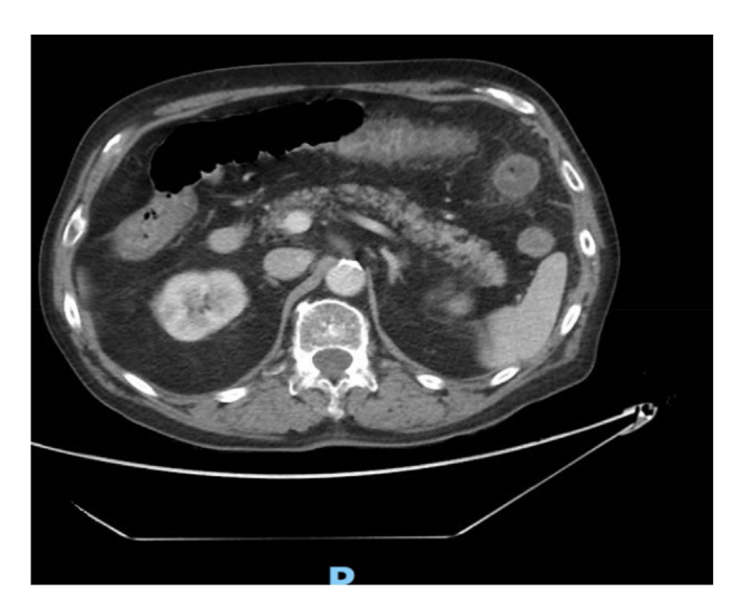
Fig. 1. CT scan showing colitis in the transverse colon.

On arrival, his vital signs were noted to be stable, and body temperature within the normal range. The physical examination exhibited moderate abdominal tenderness and protective guarding, albeit without any rebound tenderness. Laboratory investigations revealed a mildly elevated white cell