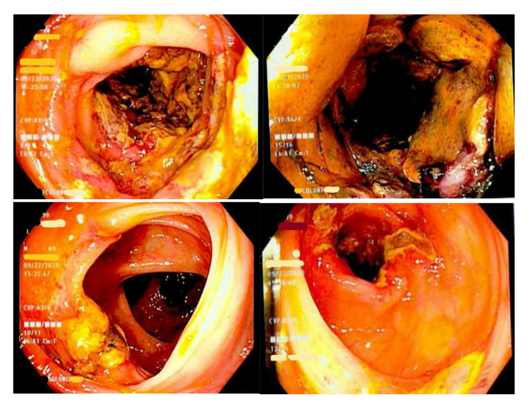
Fig. 2. Colonoscopy revealing segmental colitis of the ascending with black-yellow edematous mucosa and deep ulcers in the transverse colon and rectum.

The patient's management included bowel rest, following which he experienced symptom resolution and was subsequently discharged.