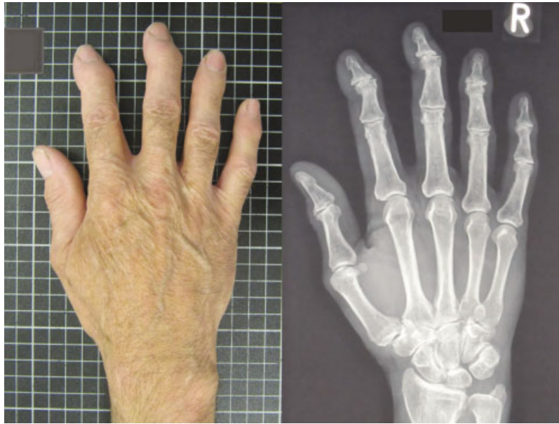
Figure 1. In this study, the associations of photographic hand osteoarthritis (OA) with radiographic OA and clinical features were examined to explore the construct validity of hand photography as an indicator of hand OA. An example of a hand photograph and its corresponding radiographic image is shown.

[PIP], and first carpometacarpal [CMC] joints) were examined for the visual presence of hard tissue enlargement, deformity, and nodes. Each joint was given a score on a 0–3 scale, with the assistance of a reference photo collection (10), where 0 = normal with no evidence of OA; 1 = mild, some evidence of OA but not fulfilling the criteria for definite disease; 2 = definite moderate OA; and 3 = severe OA. Joint groups across both hands (DIP, PIP, and CMC joints) were also graded for overall involvement of OA using the same 0–3 scale. Hand OA on the photographs was defined as grade \geq 2 for a joint or joint group. A global hand OA score was calculated for each participant from the aggregate of the joint group scores (range 0–9). The reader was blinded to clinical and radiographic data. Intra-rater reliability was assessed by the reader (HJ) scoring a random sample of photographs from 56 participants a second time after an interval of 4 weeks. A second experienced observer (GPH), who was blinded to clinical and radiographic data as well as the scores of the first reader, also graded a random sample of photographs from 60 participants to determine interrater reliability.