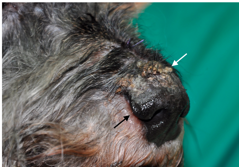
Figure 2. Crusting and scaling in the dorsal part of the muzzle (white arrow) and perinasal depigmentation (black arrow) in a schnauzer dog with stage II leishmaniosis (Group B).