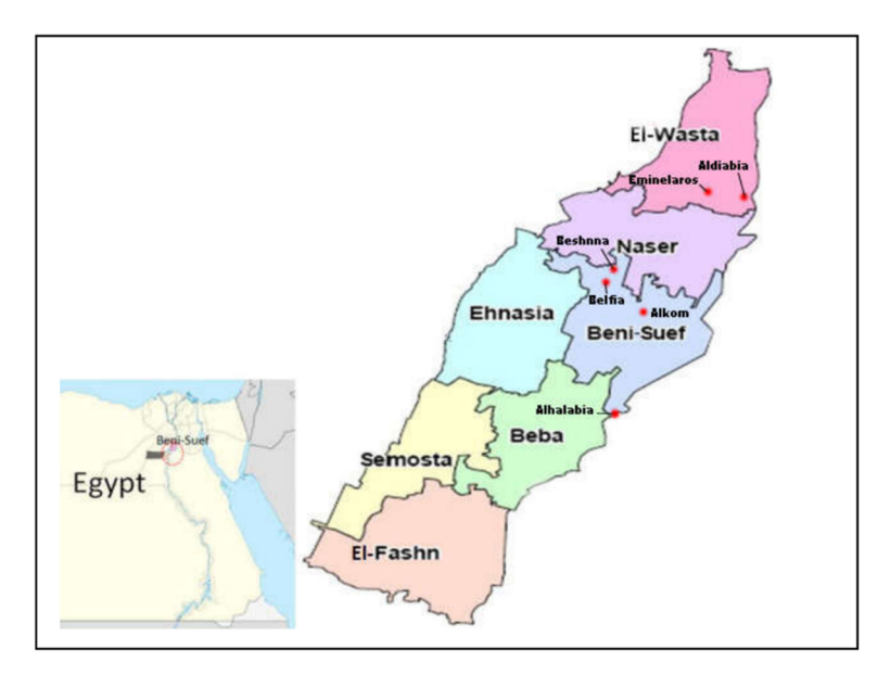
Figure 1. Map of the study area within Beni-Suef province, Egypt. Red dots indicate tick collection sites.

This study was carried out at five different localities, including Alhalabia, Alkom, Beshnna, Aldiabia, and Emin elaros in Beni-Suef province, Egypt (GPS coordinates: 29°04' N 31°05' E) (Figure 1). Farmers in these localities were interviewed and questioned to obtain data concerning whether their ivermectin use was mainly as an acaricide or anthelminthic. Furthermore, we queried the farmers as to whether ticks or parasitic worms were more of a problem in their livestock.