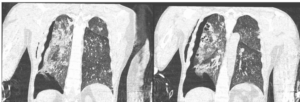
Figure 4: Lung computed tomography shows multiple pulmonary balloon lesions, and a Staphylococcus aureus infection was considered.