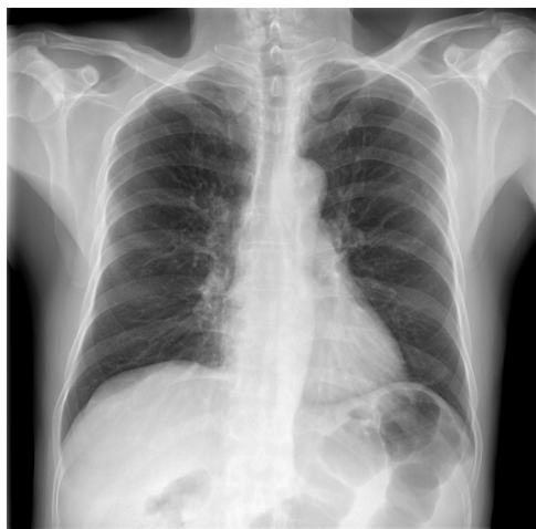
Figure 3: Chest radiographs show no obvious substantial lesions in both lungs.

Ethical approval: The research related to human use has been complied with all the relevant national regulations, and institutional policies and in accordance with the tenets of the Helsinki Declaration, and has been approved by the Second Affiliated Hospital of Anhui Medical University.