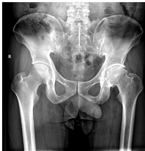
Figure 1: Plain radiograph of the pelvis shows deformation of the left femoral head, narrowing of hip space, and osteophyte hyperplasia.

The results of auxiliary tests on the first day of admission were as follows: white blood cell (WBC) count, 9.22 \times 10^9/L (neutrophils, 67.9%; lymphocytes, 9.8%); hemoglobin concentration, 124 g/L; platelet count, 231 \times 10^9/L ; erythrocyte sedimentation rate, 14 mm/h; and C-reactive protein, 10.2 mg/L. Pelvic plain radiographic images were suggestive of a deformed left femoral head, narrowed hip space, and osteophyte hyperplasia (Figure 1). Magnetic resonance imaging (MRI) revealed left acetabular bone marrow edema and a small amount of fluid in both hip joints (Figure 2). Chest radiograph showed no significant substantial lesions in both lungs (Figure 3). On admission, the patient was initially diagnosed with osteoarthritis of the left hip. Owing to the relatively obvious pain and left acetabular bone marrow edema, the patient’s condition was thought to be related to acetabular bone contusion caused by heavy physical labor. Joint replacement surgery was planned, with no administration of anti-infective therapy. On the 7th day after admission, the patient developed a persistently high retained fever over 38°C, and the hip joint pain was significantly aggravated. Laboratory tests revealed the following: WBC count, 13.42 \times 10^9/L (neutrophils, 8.38 \times 10^9/L ); C-reactive