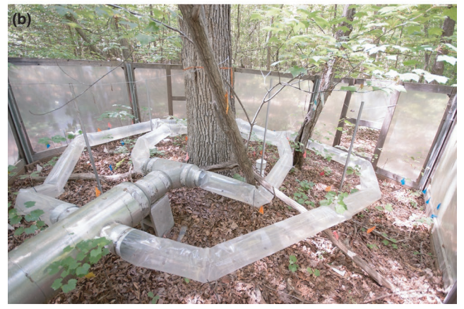
FIGURE 1 (a) Tardigrade of the genus Milnesium (SEM; scale bar = 50 \mu m ). (b) One open-top chamber experimental setup