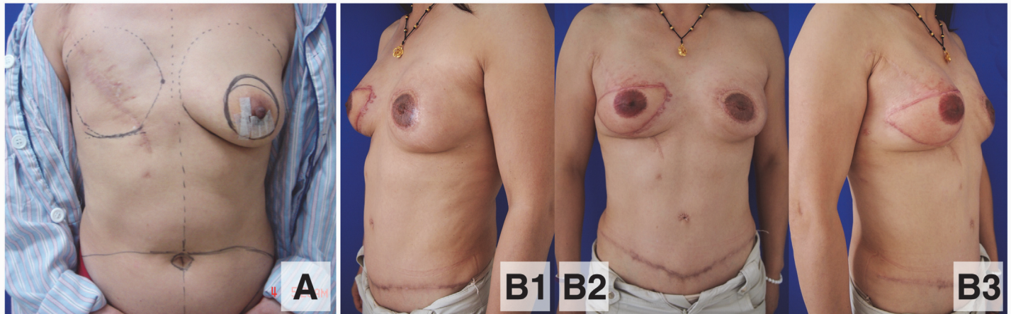
Fig 3. Bilateral autologous breast reconstruction for a patient with metachronous bilateral breast cancer. A 46-year-old patient diagnosed with metachronous bilateral breast cancer. Mastectomy was previously performed on April 15, 2006 for invasive ductal carcinoma in the right breast. A second primary invasive ductal carcinoma was diagnosed on December 24, 2010, and a skin-sparing mastectomy with immediate reconstruction with a deep inferior epigastric perforator flap was performed on the left breast. This procedure was accompanied by a delayed reconstruction with a superficial inferior epigastric artery flap performed on the right breast. Bilateral nipple-areola reconstruction and tattooing was performed 9 months later. (A) A frontal view of the patient before management of the second primary tumor; (B1-3) an 18-month postoperative view after breast reconstruction.