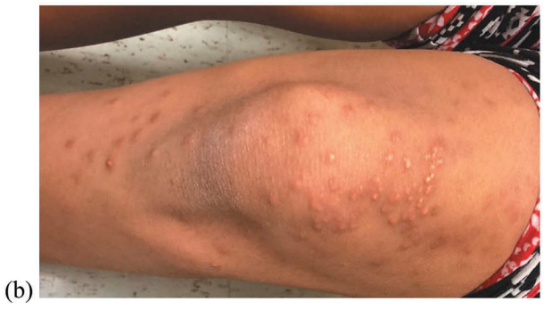
Figure 3. (a) Before treatment, (b) 2 months after treatments.

when seen in a younger patient. Tuberous xanthomas are primarily located over joints and present as firm, painless, red-yellow nodules that often merge into forming multi-lobated tumor-like lesions. They can be associated with severe hypercholesterolemia and elevated LDL levels and some of the secondary hyperlipidemia (e.g. nephrotic syndrome, hypothyroidisom). Tendinous xanthomas are slowly enlarging subcutaneous nodules in association with the tendons or the ligaments. The usual locations include the extensor tendons of the hands, the feet and the Achilles tendons. The tendinous xanthomas associated with severe hypercholesterolemia and elevated LDL levels, particularly in familial hypercholesterole-