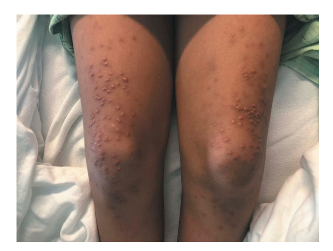
Figure 2. Eruptive xanthoma in bilateral lower extremities extensors.