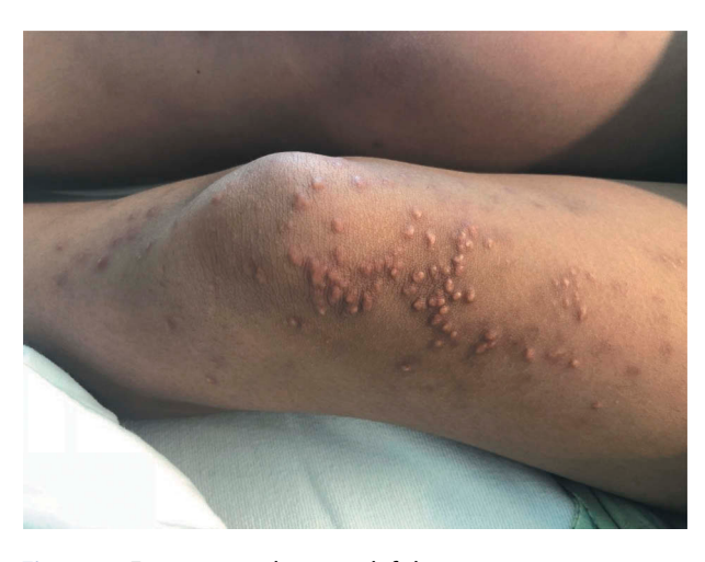
Figure 1. Eruptive xanthoma in left lower extremity extensor.