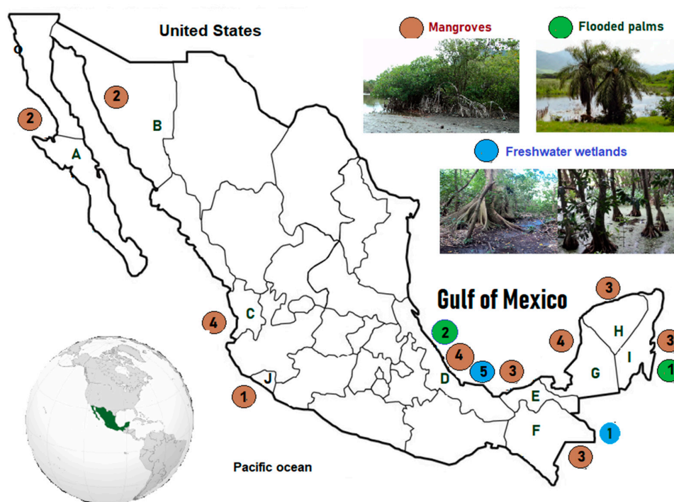
Figure 1. Location of the forested wetlands reviewed. Places represented by letters are referenced in Tables 1 and 2. The number inside the circle is the number of studies in that state/site.

The lack of public policies to protect the FW has caused land use change, mainly from tropical wetlands to pastures for the introduction of cattle [52], the degree of impact depends on the number of cows, the time they are in the wetland transformed, and modifications to hydroperiod and vegetation. Comparing the carbon stock observed for tropical Mexican FW with the C stocks in other sites, this is up to 50% larger than observed for FW in Pennsylvania, 7 to 30 kg C m -2 were reported [53]. Similarly, 11–29 kg C m -2 were detected for alpine and other FWs in south-eastern Australia [54]. Carbon storage in ranges from 2 to 20 kg C m -2 were reported in FW of South Korea [55]. The above shows the importance of conserving and creating new FW. With the data that we documented, a measure that helped to enhance carbon storage in soil and therefore enable these ecosystems remains vital in global carbon balance and climate change mitigation.