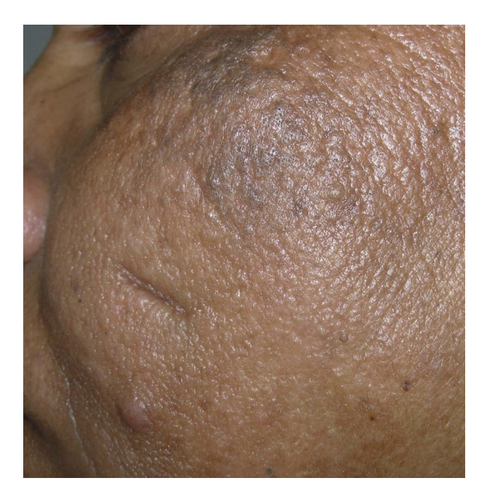
Figure 2 Multiple comedones on the upper cheek and a solitary inflammatory papule.

macrocomedones in the frontal and side regions of the face is usually seen in patients beyond 40 years and in smokers (Figure 2). Another variant described in menopausal acne is the presence of multiple closed comedones visible on stretching the skin, along with enlarged pores in the nasal and malar areas. In elderly patients (>60 years), acne has a predominant truncal distribution and is often resistant to