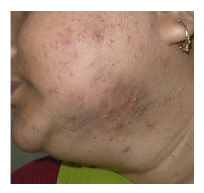
Figure I Inflammatory papules, deep-seated nodules and comedones on the lower cheek, mandibular area, extending to the neck in an obese perimenopausal woman.

macrocomedones in the frontal and side regions of the face is usually seen in patients beyond 40 years and in smokers (Figure 2). Another variant described in menopausal acne is the presence of multiple closed comedones visible on stretching the skin, along with enlarged pores in the nasal and malar areas. In elderly patients (>60 years), acne has a predominant truncal distribution and is often resistant to