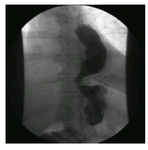
FIGURE 3: Pouch dilatation following sleeve gastrectomy.

surgery. It is vital that a clear understanding that revisional surgery can be two or three times more demanding on both the patient and the surgeon as compared with the original primary procedure.