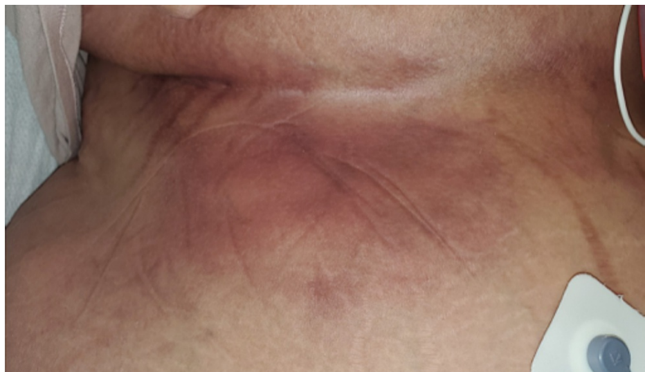
FIGURE 2: CUA lesion under right breast of patient extending caudally to the abdomen.