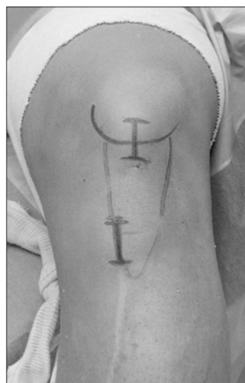
Fig. 1. Our incision approach. Longitudinal double incisions of approximately 25 mm each are made over the inferior pole of the patella and the area just medial to the tibial tubercle.

The graft harvest for all patients was performed using the following steps: The patient was positioned supine with a lateral post placed just proximal to the knee, at the level of a padded tourniquet, and a foot roll was used to prevent the hip from externally rotated and to maintain knee flexion at 90°. A pneumatic tourniquet was generally not used; it was applied when it was needed to be inflated intraoperatively. Longitudinal double incisions, approximately 25 mm each, were made over the inferior pole of the patella and over the area just medial to the tibial tubercle (Fig. 1). The incisions were performed layer by layer up to the patellar tendon. The paratenon was identified, incised longitudinally, and dissected both medially and laterally. A 10 mm graft was marked and incised from the central third of the patellar tendon. The patellar bone block was marked at a length of 12 mm from the inferior pole and a width of 10 mm. An osteotomy