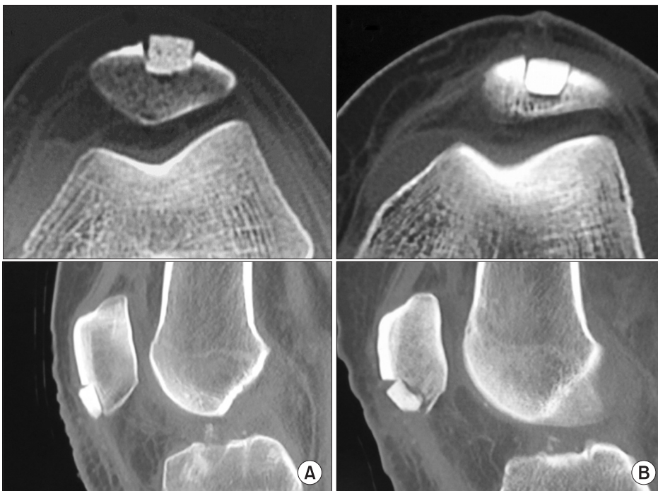
Fig. 3. Axial computed tomography of the knee showing protrusion of the graft (A) and the graft without protrusion (B). Based on this information, all cases were classified into two groups: a protrusion group (n=31) and a non-protrusion group (n=53).