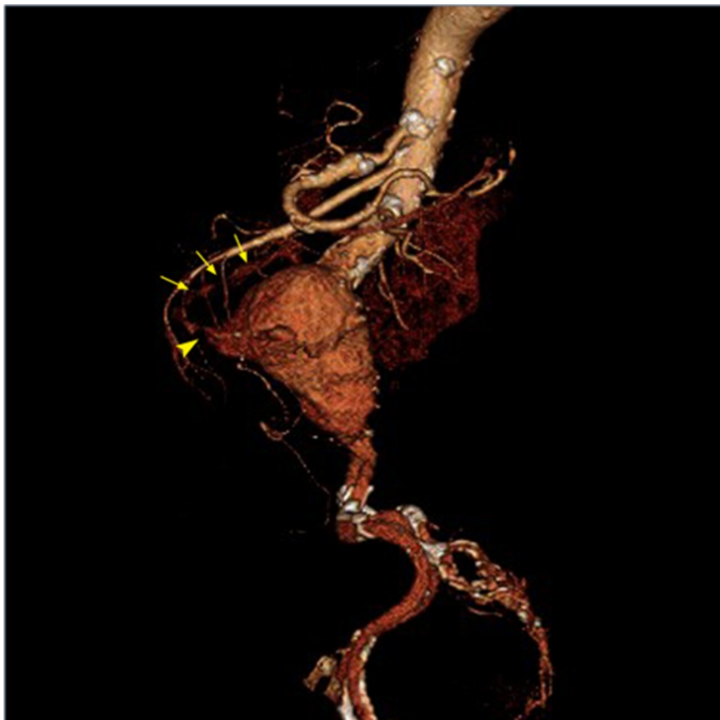
FIGURE 4: 3D Reconstruction of PAEF

Left lateral 3D reconstructed contrast-enhanced (IV only) CT image showing the presence of an AAA, fistula (arrowhead), and layering contrast within the 3rd part of the duodenum (arrows).