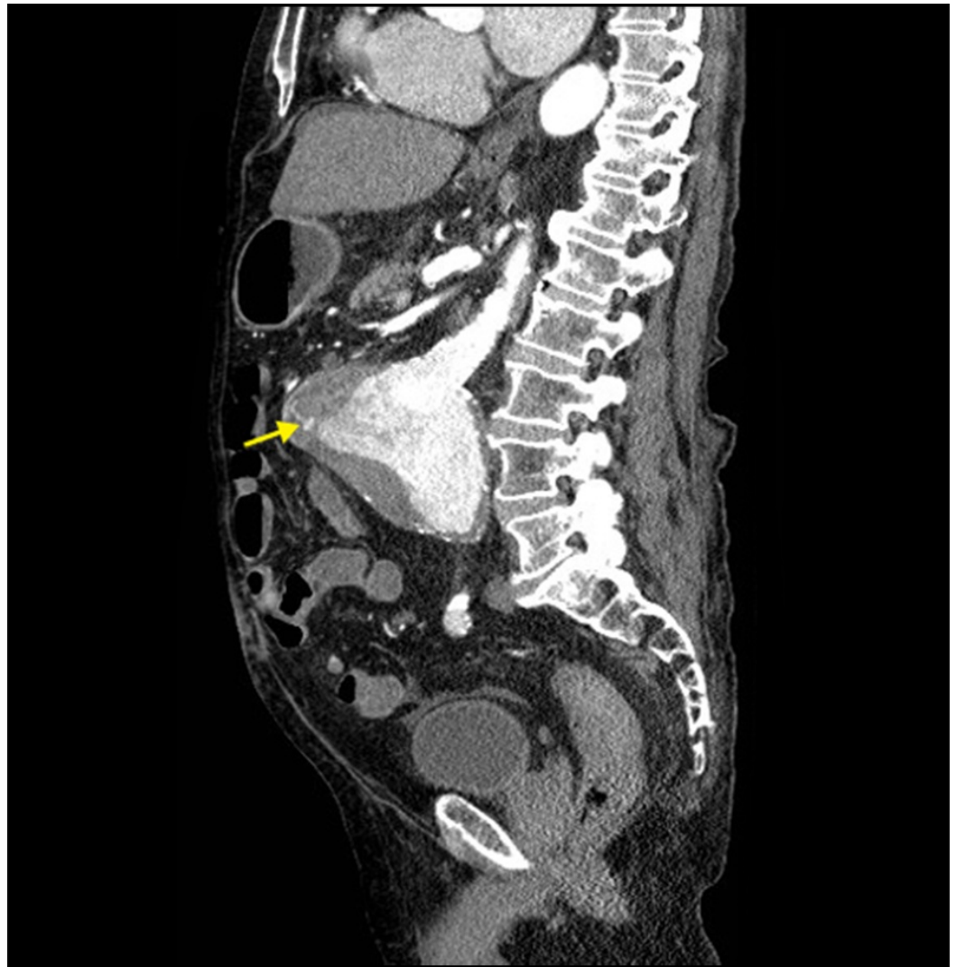
FIGURE 3: PAEF From Another View

Axial contrast-enhanced (IV only) CT image, obtained a few slices inferior to Figure 1, shows an abdominal aortic aneurysm (AAA) measuring up to 11 cm and presence of a fistula leading into the duodenum (arrow).