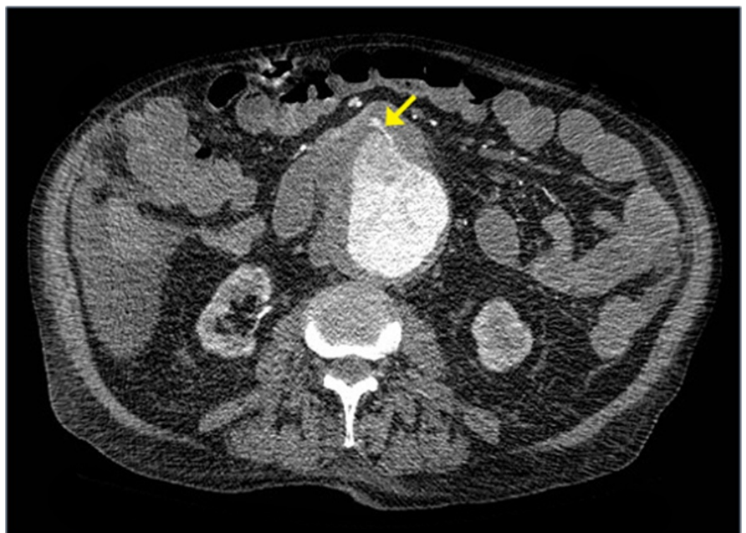
FIGURE 2: Primary Aortoenteric Fistula (PAEF)

Axial contrast-enhanced (IV only) CT image at the level of the kidneys showing the abnormal presence of contrast in the 3rd part of the duodenum (arrows).