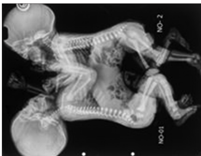
Figure 2: Babygram