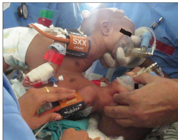
Figure 3: Twins during preoxygenation

was administered, and for massive blood loss IV tranexamic acid was given. The surgery lasted nearly 8 h. The first baby received 600 ml of total IV fluid (including 100 ml of packed RBC and 80 ml of other blood products), whereas the second