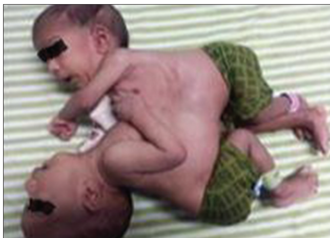
Figure 1: Twins before surgery

Intraoperatively, there was massive blood loss during separation of liver parenchyma and both the babies developed severe hypotension (blood pressure fell up to 42/20 mmHg) and drop in hemoglobin level (4.2 and 4.4 g/dl, respectively). It was managed by bolus IV fluids, implementing massive blood transfusion protocol (also replacing plasma and platelets), and vasopressors. The estimation of blood loss from individual baby was very difficult. In the absence of central venous pressure (CVP) monitoring, the intravascular volume assessment was done according to the vital parameters, hourly ABG, and urine output monitoring. Blood loss was assessed by measuring surgical sponge and calculating drain output from surgical area, although accurate assessment was not possible. Because of excessive IV fluids and massive blood transfusion, patients developed metabolic acidosis (pH 7.21 and 7.23), hyperkalemia (potassium 5.68 and 5.8 mEq l/dl), and hyperglycemia (glucose 320 and 350 mg/dl, respectively), which were successfully managed by IV calcium gluconate and insulin infusion. For persistent metabolic acidosis and refractory hypotension, IV sodium bicarbonate