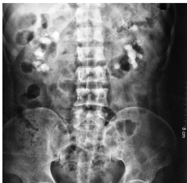
Figure 1 Straight X-ray abdomen showing bilateral staghorn renal calculus without any hydronephrotic changes.

Subsequently, the patient was referred for parathyroid surgery. Histopathology of parathyroid glands revealed diffuse hyperplasia (Fig. 2).