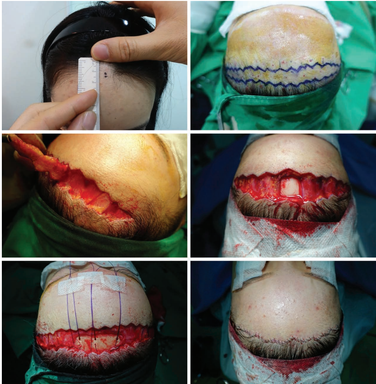
Fig. 1. Surgical techniques of multiplane forehead shortening. (Above, left) Deciding the amount of skin excision by the gliding test. (Above, right) Designing the excisional line. (Center, left) Skin excision, sparing the superficial branches of the supraorbital nerve. (Center, right) Making a 5 × 10-mm window for subgaleal dissection. (Below, left) Fixing the posterior scalp flap on the skull with three suture points. (Below, right) Closing the flap, layer by layer.

subperiosteal dissection is preferred instead of subgaleal dissection to avoid injuring the deep branch of the supraorbital nerve. The forehead flap should not be dissected, and only the dissected posterior scalp flap should be advanced anteriorly. If tension on the scalp flap is still observed when advancing the flap, scoring incisions can be made on the galea layer of the scalp flap. The galeotomies should be performed horizontally, at distances of 2 cm.