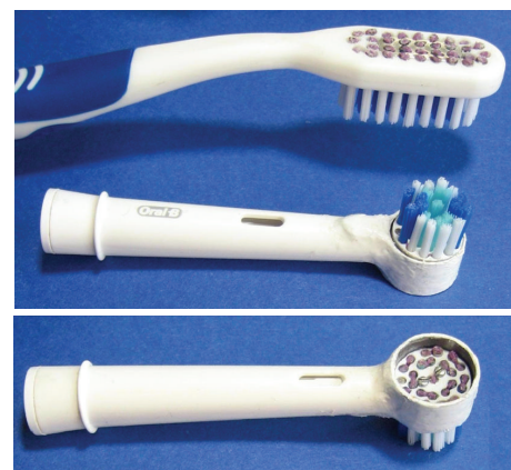
FIGURE 1: Manual toothbrush and electrical toothbrush head, modified with the proposed mechanism.

Each model was brushed with the manual prototype (modified Silver Care Plus). After the removal, the plaque