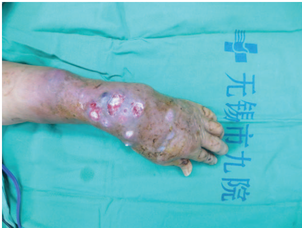
Figure 1. Skin festered in the back of left hand.