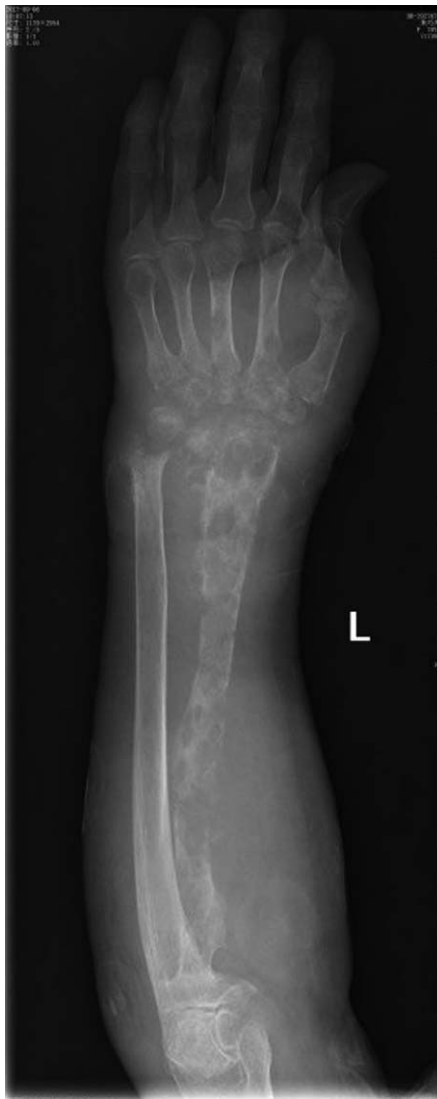
Figure 2. We could see radius, ulna, and carpal were eroded and disappeared in x-ray.

11.4 \times 10^9/L , red blood cell (RBC): 4.12 \times 10^{12}/L , C-reactive protein (CRP): 22 mg/L, erythrocyte sedimentation rate (ESR): 47 mm/h. Considering the serious illness, we decided to performed left forearm amputation. On September 12th, 2017, from Fig. 3, we could clearly see extensive infection in the soft tissue of left forearm. We collected some soft tissue and conducted pathological examination. Finally, pathological result showed MTB infection. That patient was diagnosed with extensive infection in the left forearm caused by recurrent whitlow infected by MTB. We performed left forearm amputation (Fig. 4). That patient was treated with antituberculosis therapy afterwards. One week after surgery, x-ray presented no osteolysis in humerus, as shown in Fig. 5. Laboratory tests revealed WBC: 7.6 \times 10^9/L , RBC: 4.09 \times 10^{12}/L , CRP: 6 mg/L, ESR: 18 mm/h. Up to now, the condition of that patient is good.