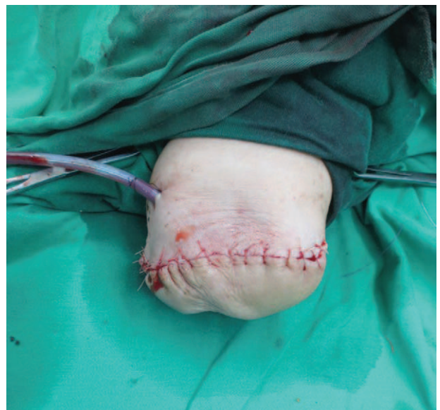
Figure 4. Forearm amputation.

Whitlow is not a rare disease in practice. There are 4 types of whitlow: subcuticular, subcutaneous, thecal abscess, and subperiosteal