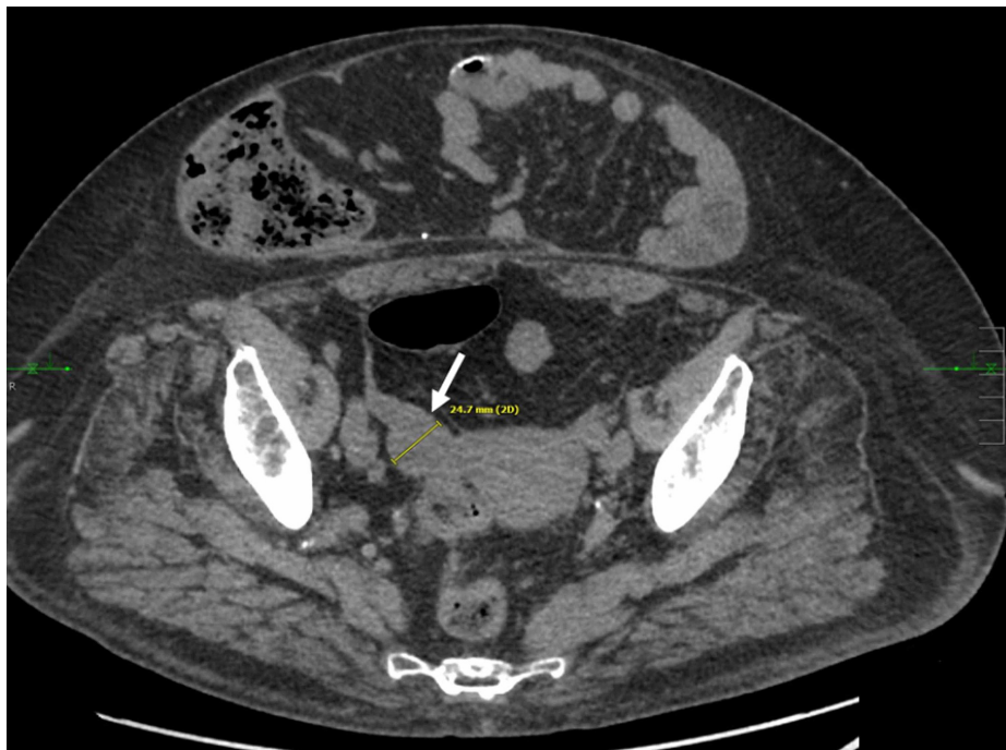
FIGURE 1: Routine surveillance CT demonstrating no evidence of metastatic disease of the right ovary

The patient is a 67-year-old female that was diagnosed with a small bowel carcinoid tumor. Hepatic metastasis was detected after initial resection demonstrated incomplete margins. In the nine years since the discovery of distant metastasis, the patient underwent five PC hepatic cryoablations, five intra-arterial hepatic chemoembolizations, and trans-ventral hernia mesenteric cryoablation. Standard surveillance imaging throughout that time demonstrated a normal-sized ovary without evidence of metastasis (Figure 1).