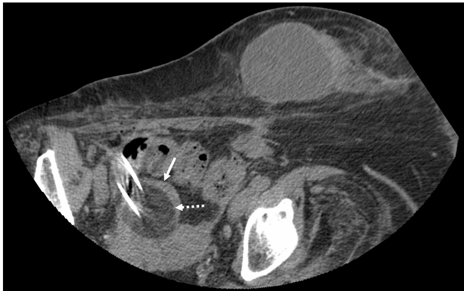
FIGURE 3: CT scan of the pelvis at the time of the cryoablation procedure

Axial non-contrast CT obtained during cryoablation demonstrates positioning of two cryoprobes within the right adnexal mass (solid white arrow) along with formation of a hypodense "ice ball" encompassing the lesion (dashed white arrow).