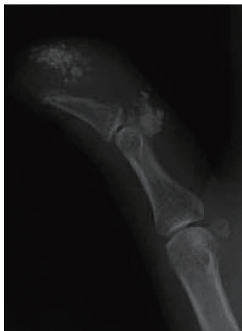
Fig. 1. Plain radiograph demonstrating soft tissue calcification in the volar aspect of the distal thumb at the level of the distal phalanx and at the head of the proximal phalanx with acro-osteolysis of the distal phalanx.

Systemic sclerosis is an autoimmune connective tissue disease that may affect the hands [1]. Hypercalcinosis in systemic sclerosis is a rare and poorly defined entity characterized by widely metastatic benign calcific deposits [2]. We describe a case of bilateral upper extremity hypercalcinosis requiring multiple radical debridements, in which