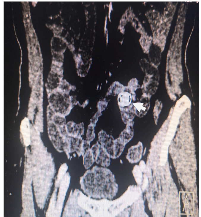
Fig. 2. Examination of computed tomography enterography (CTE) showed slight thickening and enhancement of ileocecal region and part of ileum wall , dense shadows in small intestine of pelvic cavity (arrow).